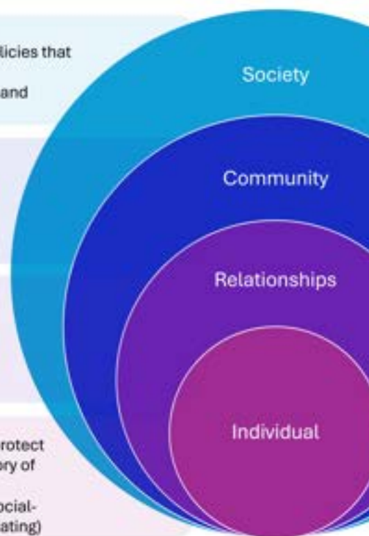
Figure 1. Social-ecological model

For additional resources regarding the socio-ecological model and coordinated and comprehensive violence prevention efforts, please see: